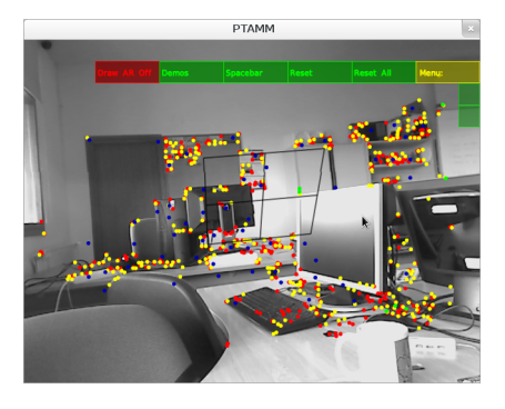
Fig. 2. PTAM interesting points detected

As snapshot messages, location events are sent to event channels too. This way the information can reach different consumers for different purposes. In summary, mobile nodes are snapshot publishers and location subscribers, but not